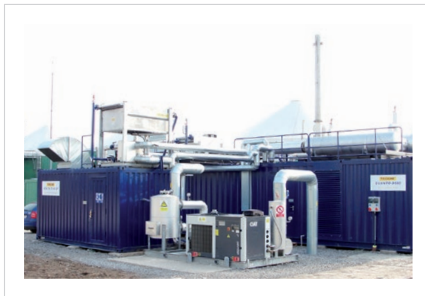
Biogas plant Chonkovce - GTS 800