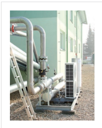
Biogas plant Vysoké Mýto - GTS 400