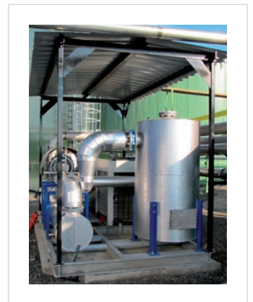
Biogas plant Pustejov - GTS 1200